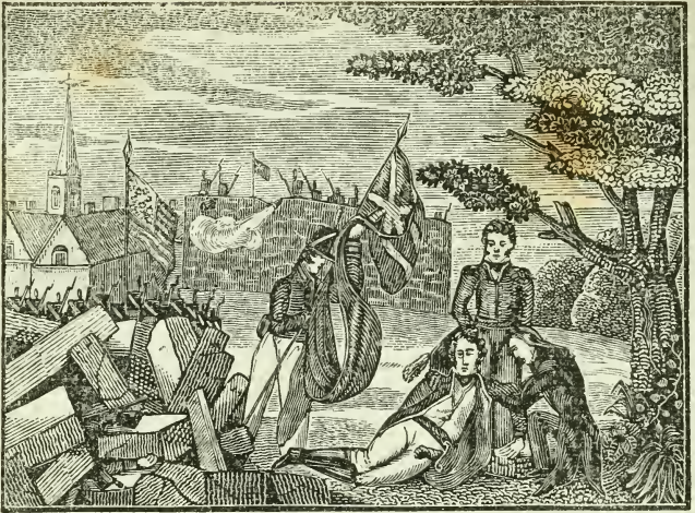
TAKING OF YORK, AND DEATH OF GENERAL PIKE.